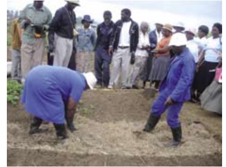
Dryland farmers learning new technologies and methods as part of the 'Partnership for Sustainable Agriculture'.

One of the major reasons for the success of this project was the participatory, collaborative manner in which this initiative was managed. Engagement with the project deepened the understanding of the various stakeholders of multi-stakeholder partnerships and what is necessary for them to be fruitful. The project also facilitated their mutual support for one another in promoting longer term